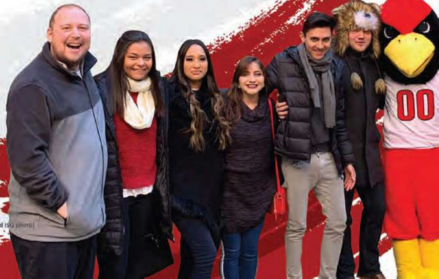
Original photo