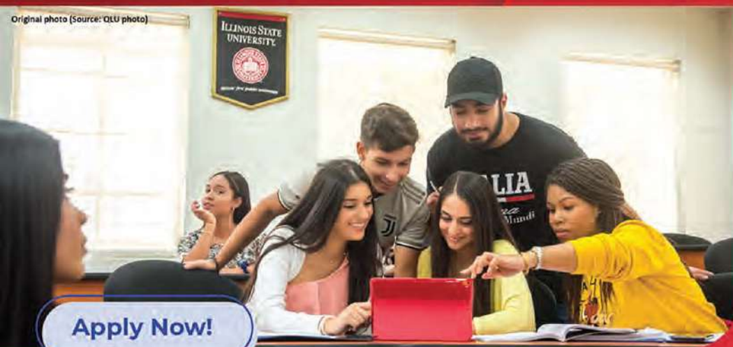
Original photo