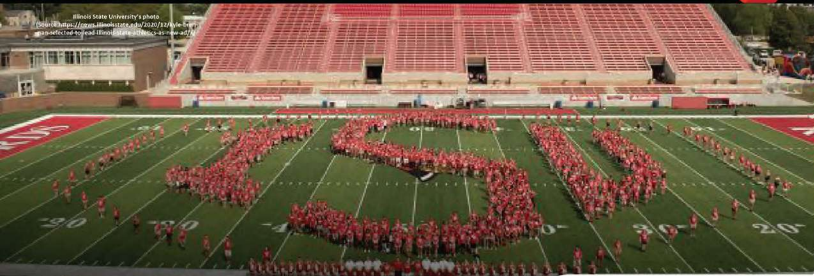
Illinois State University's photo (Source: https://news.illinoisstate.edu/2020/12/style-brigade-man-selected-to-lead-illinois-state-sportletics-as-new-ad/ )