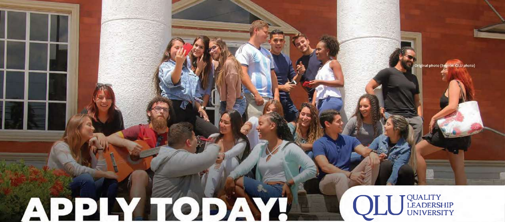
Original photo