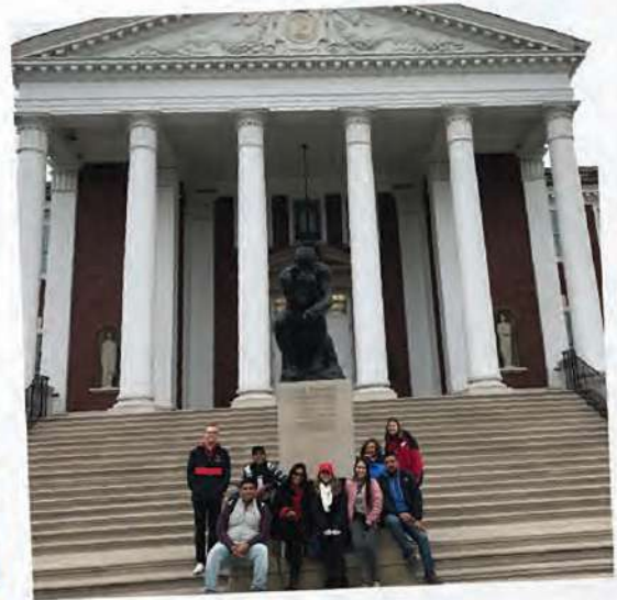
Original photo