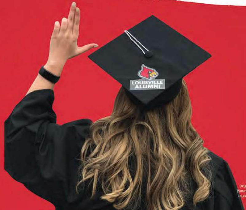
Original photo