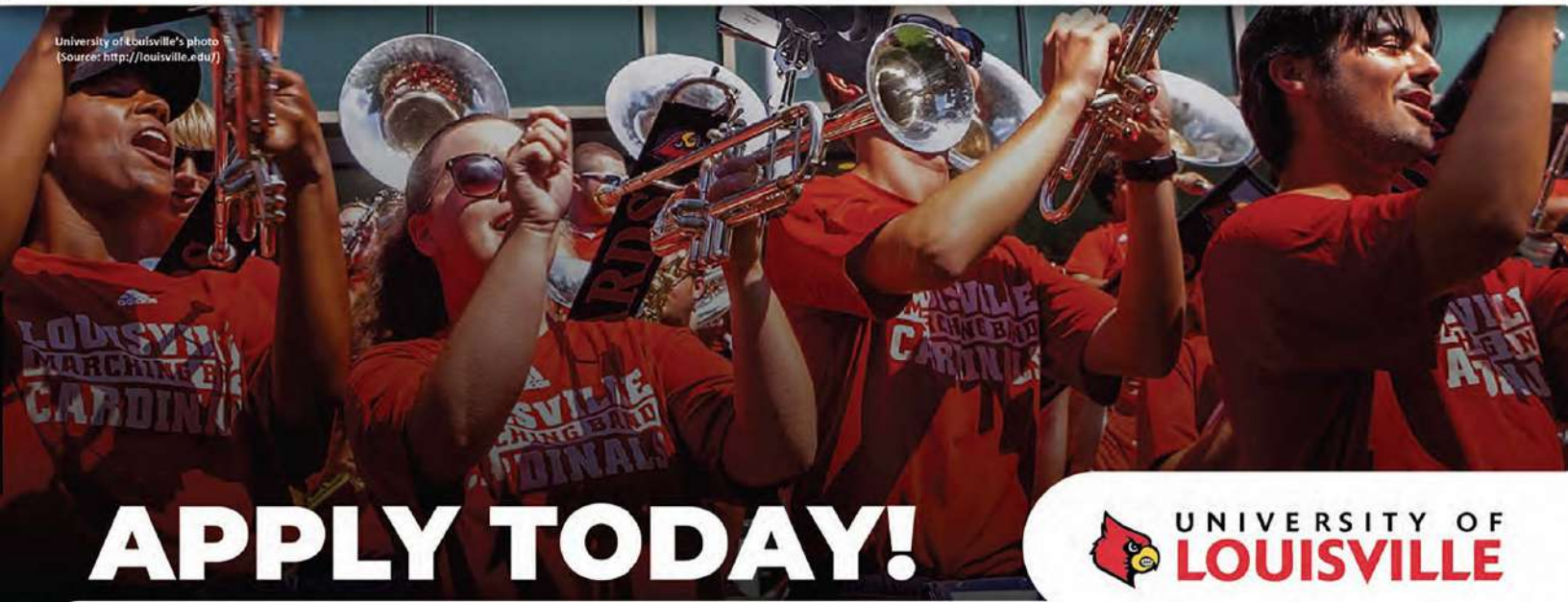
University of Louisville's photo (Source: http://louisville.edu/ )