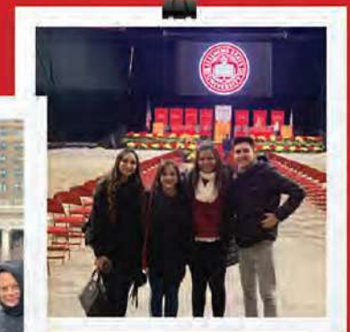
Original photos