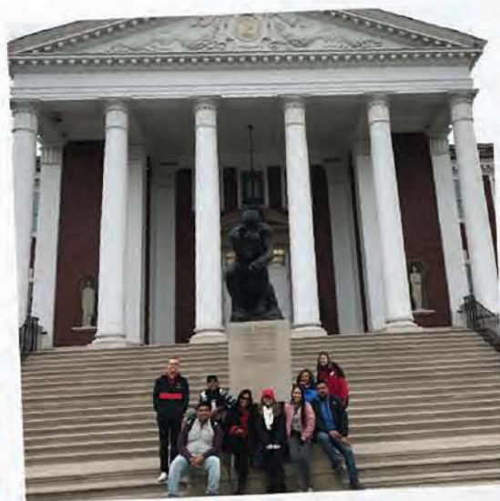
Original photo