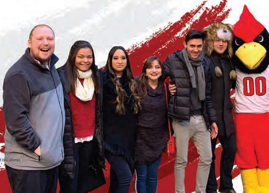
Original photo