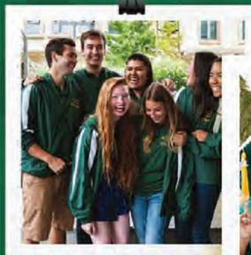
USFphotos (Source: www.usf.edu )